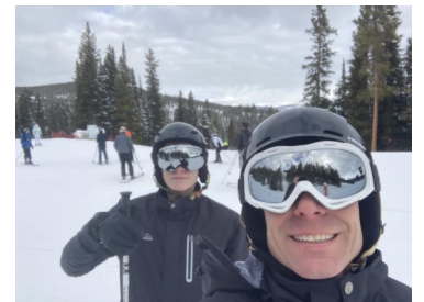
Spring Break Winter Park